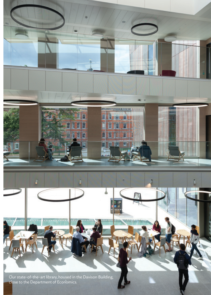
Our state-of-the-art library, housed in the Davison Building, close to the Department of Economics.

Cutting-edge resources including Express Lab and Bloomberg financial database